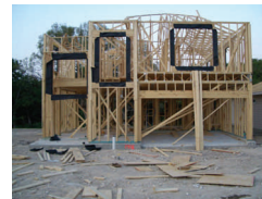
Building and Safety primarily enforces County regulations concerning construction activities on private property in unincorporated areas.

If you are unable to determine if your work requires a permit, you may contact the permit counter during regular business hours at (951) 955-1800.